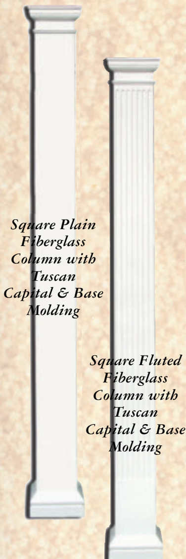
Square Plain Fiberglass Column with Tuscan Capital & Base Molding